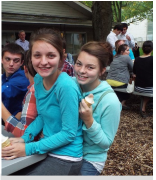
Togetherness . . . :-)