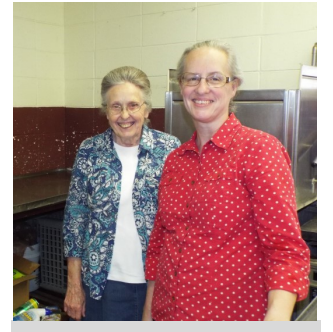
Mother/ Daughter helping in the kitchen