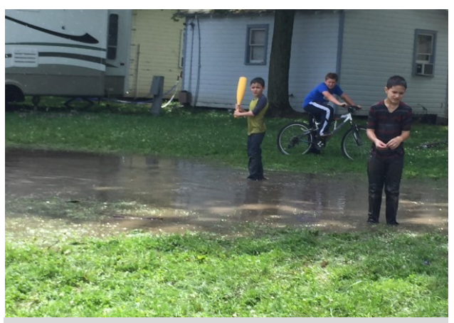
There was no shortage of mud puddles this year