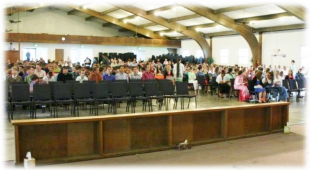
Night after night, the tabernacle was filled with people worshipping God