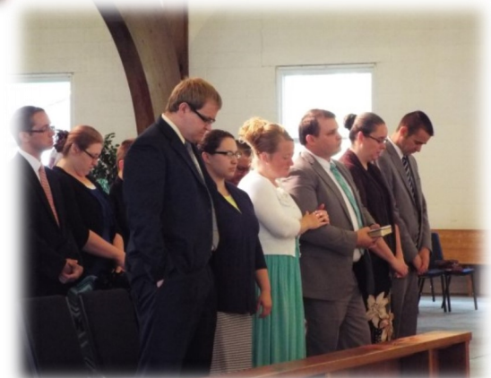
The candidates awaiting ordination