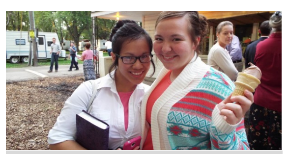
The Snack Bar now has ICE CREAM!!