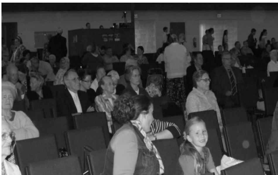
Photo taken prior to an evening service at Pilgrim Camp 2014