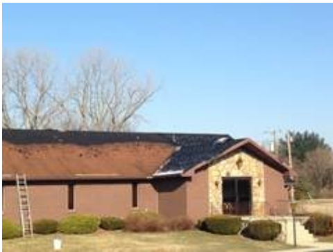
The WORK has begun!

God is at work! In March, the MPHC began the first project in phase I of the New Beginnings Project by having a new roof put on the church building. The original roof had deteriorated to the point that it demanded attention. On April 21st, several people gathered on the church campus to begin removing pews, décor, and other items to prepare for a major remodel of the sanctuary, bathrooms, hallways, and foyer of the church. After a lot of hard work from contractors and parishioners, we held a rededication service on May 18th. To God be the glory!