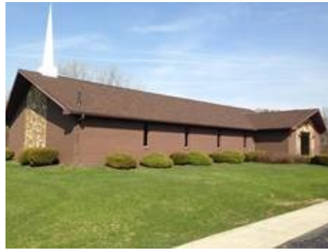
Phase I "FINISHED"