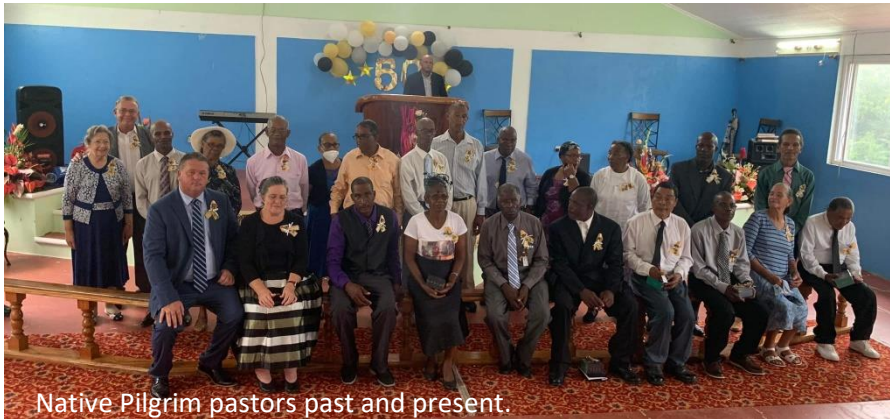
Native Pilgrim pastors past and present.