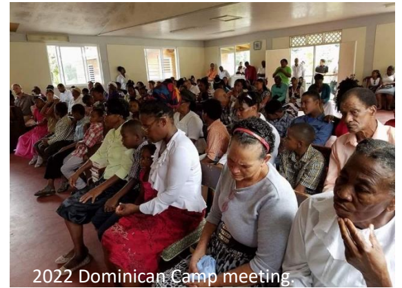
2022 Dominican Camp meeting.