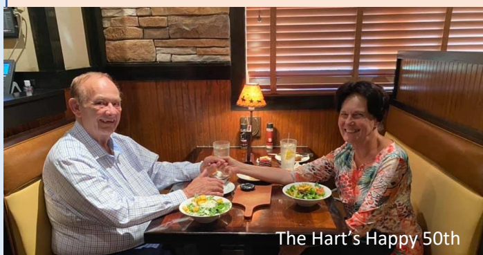
The Hart's Happy 50th