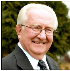
BY ROWAN FAY